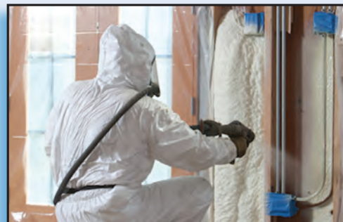
Worker applying SPF interior insulation