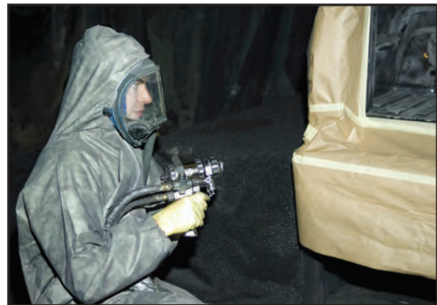
Worker applying spray-on polyurethane truck bed liner