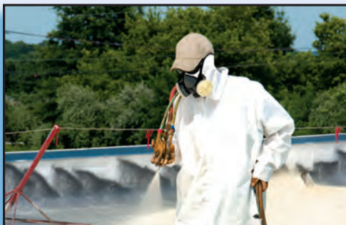
Worker applying SPF roofing material