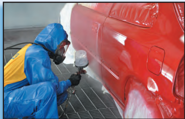
Worker applying spray paint to automobile

See page 3 for more information on respirator programs.